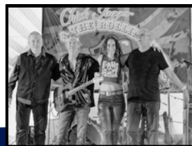
"Chick Jagger and the Rolling Tones"