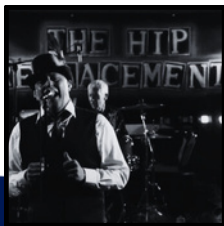
"The Hip Replacements"

This popular Tribute Band has been performing Hip music it's members love for twenty years at clubs, festivals, concerts and private events.